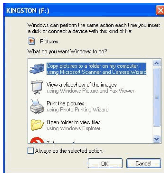
Figure 1 USB Storage Device Configuration Menu